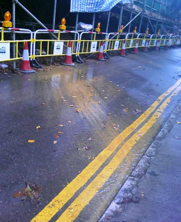
Photographic record for exceedance of Suspended Solid recorded at Sik Sik Yuen Ho Fung College (I-1) on 05-Sep-08