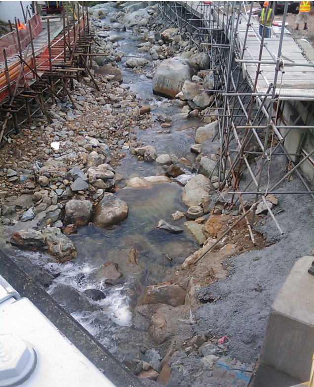
Photographic record for exceedance of Suspended Solid recorded at Hong Hoi Chee Hong Temple (I-2) on 25-Sep-08