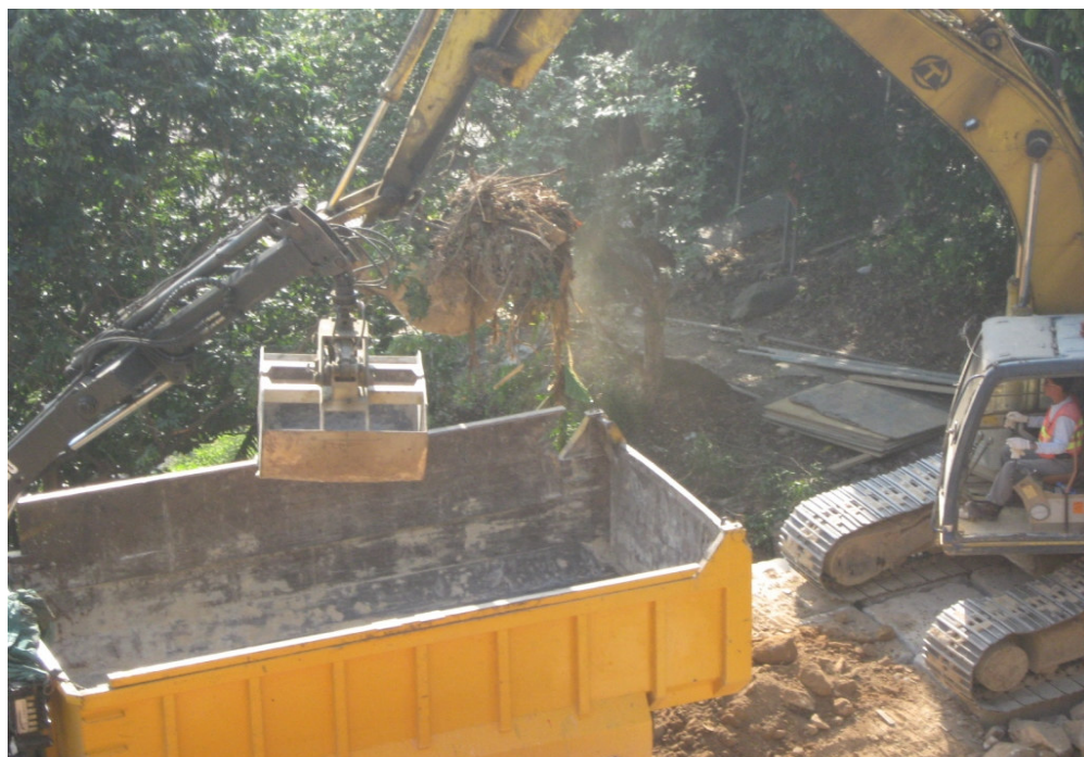
Photographic record for exceedance of Total Suspended Particulate recorded at Greenview Terrace (ASR9) on 27-Nov-08