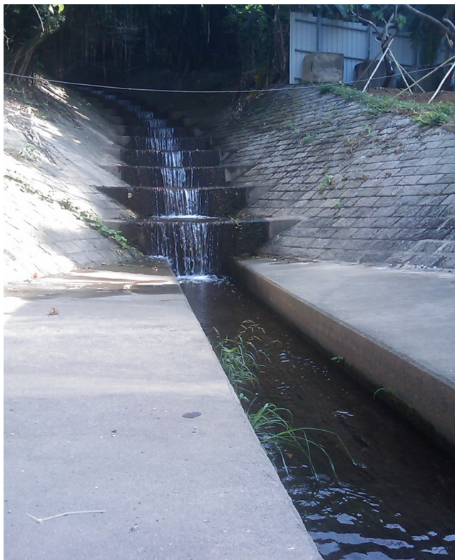
Photographic record for exceedance of Suspended Solid recorded at Sik Sik Yuen Ho Fung College (I-1) on 17-Nov-08