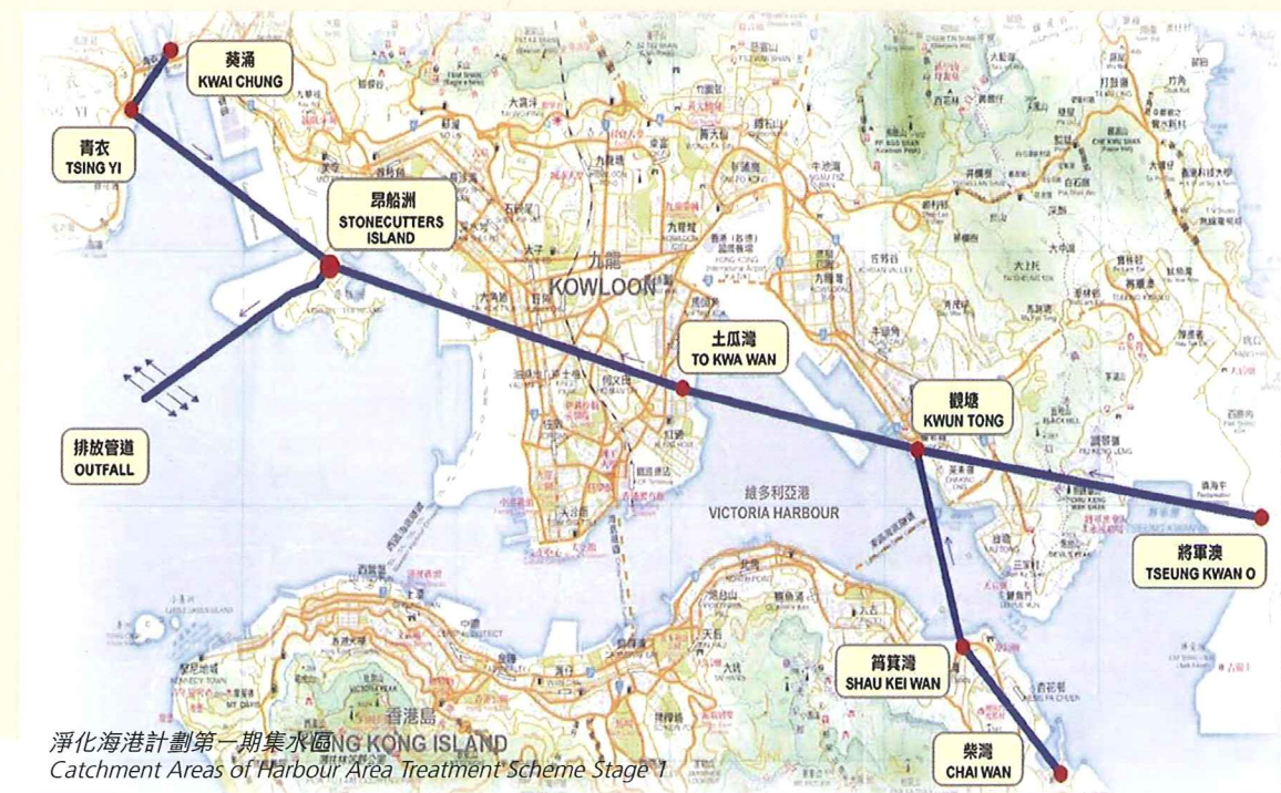
淨化海港計劃第一期集水區 KOWLOON ISLAND Catchment Areas of Harbour Area Treatment Scheme Stage 1