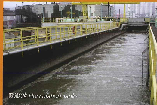
絮凝池 Floculation Tanks