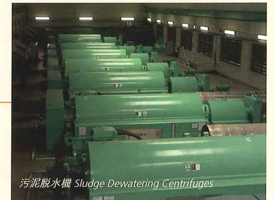
污泥脫水機 Sludge Dewatering Centrifuges

After being pumped into holding tanks, the settled sludge & scum will be mixed with polymer before being pumped again into the centrifuge for dewatering to achieve a minimum dryness of 30%. The dewatered sludge would then be transported using sealed containers for disposal at landfill. The facilities have a maximum treatment capacity of 900 tonnes of sludge cakes per day.