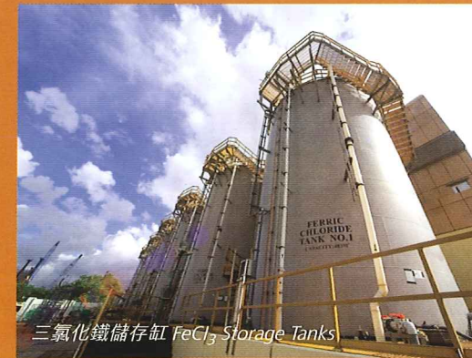
三氯化鐵儲存缸 FeCl 3 Storage Tanks

In order to save space, double-deck sedimentation tanks have been adopted.