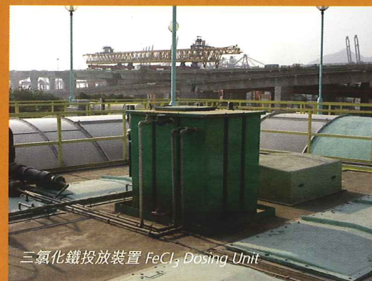
三氯化鐵投放裝置 FeCl 3 Dosing Unit