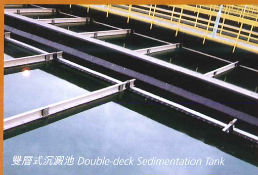
雙層式沉澱池 Double-deck Sedimentation Tank