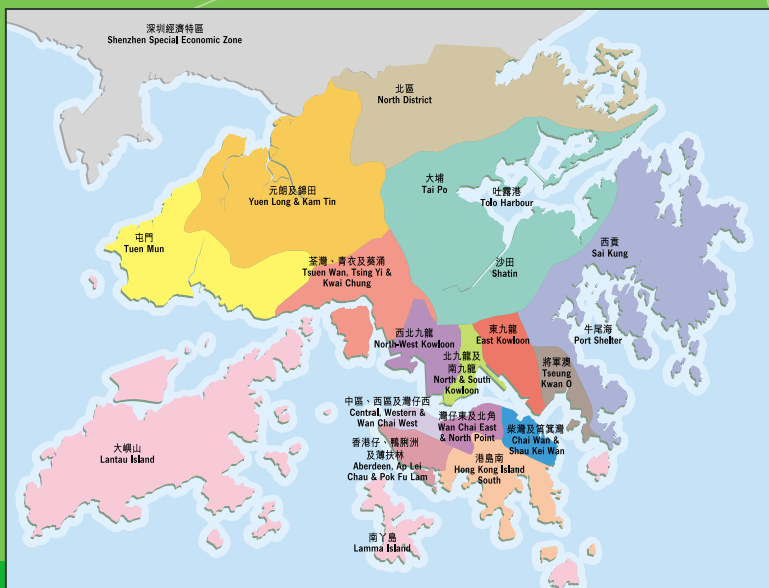
「污水收集整體計劃」地區 Sewerage Master Plan Areas

海水污染，影響民生。「污水收集整體計劃」提昇全港各區的污水收集及處理設施。 Water pollution affects people's livelihood. The Sewerage Master Plan Programme aims at providing adequate sewerage infrastructure for the community on a catchment-by-catchment basis.