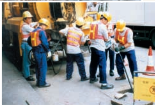
直屬員工隊隊員正在利用大型水車清理淤塞的渠道 Members of Direct Labour Force are operating a large water jetting unit to clear drainage blockages

The Engineering Survey Team is using an infra-red reflector to carry out a topographical survey of stream course in the New Territories. The main purpose is to identify potential flooding spots for follow-up actions by the department.