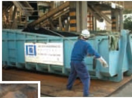
一名技工正在把污泥餅放入吊斗，以便稍後卸置到堆填區 An artisan is leveling sludge cakes into a skip which will be unloaded at landfills later.