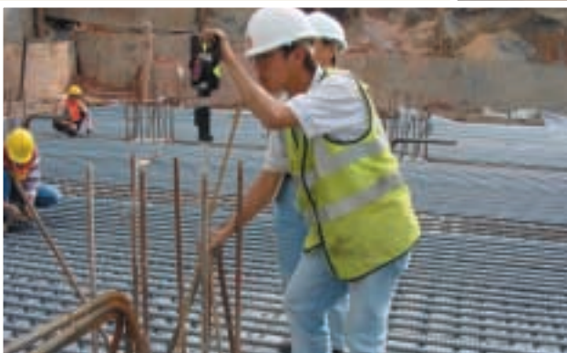
工程測量隊隊員正使用紅外線反射器，為新界一條河道進行地形測量。這項測量的主要目的是要找出潛在的水浸黑點，以便部門作出跟進。

The Engineering Survey Team is using an infra-red reflector to carry out a topographical survey of stream course in the New Territories. The main purpose is to identify potential flooding spots for follow-up actions by the department.