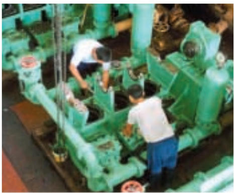
兩名技工正在檢查污水處理廠內的機械裝置 Two artisans are inspecting a mechanical installation at a sewage treatment works