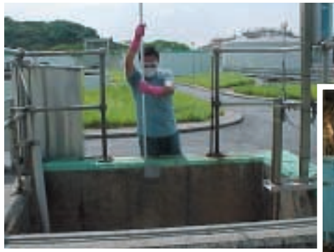
一名實驗室人員正從排放井中抽取水質樣本 A laboratory staff is getting water samples from the discharge chamber