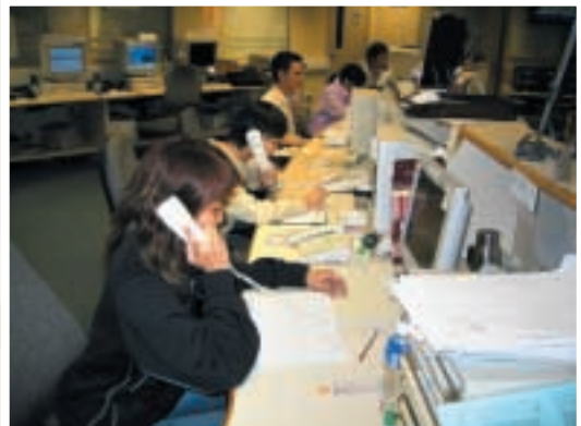
顧客服務助理在熱線中心處理市民有關渠道問題的報告 A group of Customer Services Assistants are handling public reports on drainage problems at the Hotline Centre