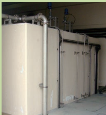
雙濾層濾池 Dual Media Tertiary Filter