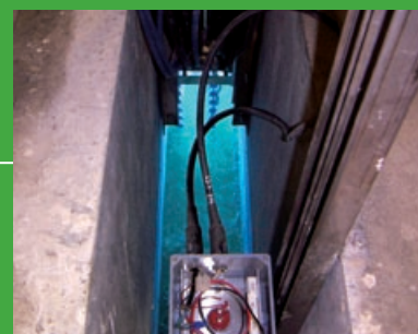
紫外光消毒槽 UV Disinfection Channel

After tertiary treatment, effluent is disinfected by ultraviolet light before being discharged to Tung Wan of South Lantau Island via effluent export pipe.