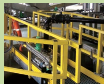
渦流集砂器 Vortex Grit Trap