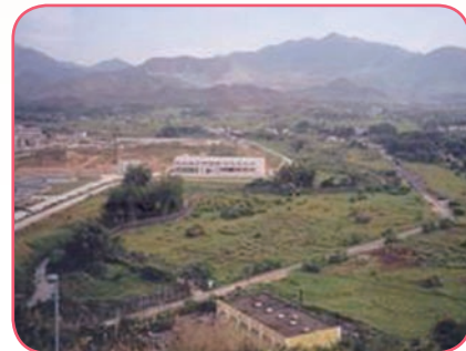
平原河匯流處 Confluence with Ping Yuen River