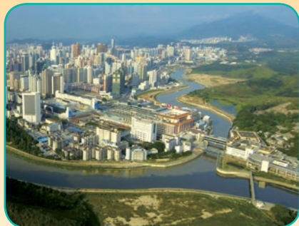
工程後 After River Training