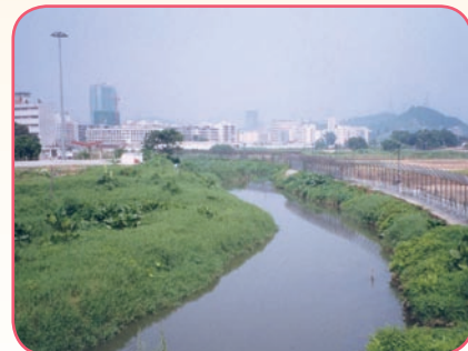
文錦渡橋上游 Upstream of Man Kam To Bridge