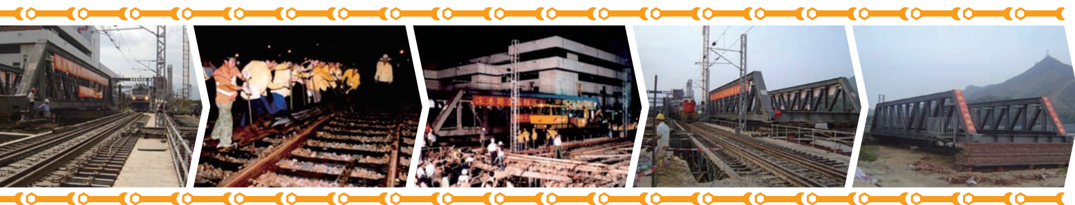
羅湖鐵路橋的遷移過程 Shifting of Lo Wu Railway Bridge

A system of pulley and trolley was used to shift the Lo Wu Railway Bridge to its final position. This construction method enabled the whole Bridge to be preserved in its original form without causing any damages.