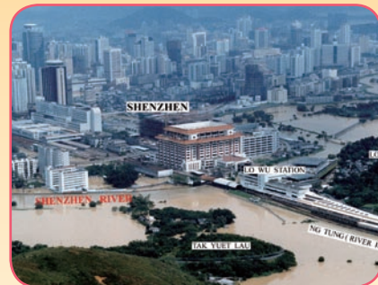
羅湖 Lo Wu